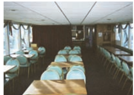
The vessel's new cherry paneling, the state-of-the-art tiled ceiling, and new furniture adds seating flexibility and beauty to the Tahoe Gal's dining room.