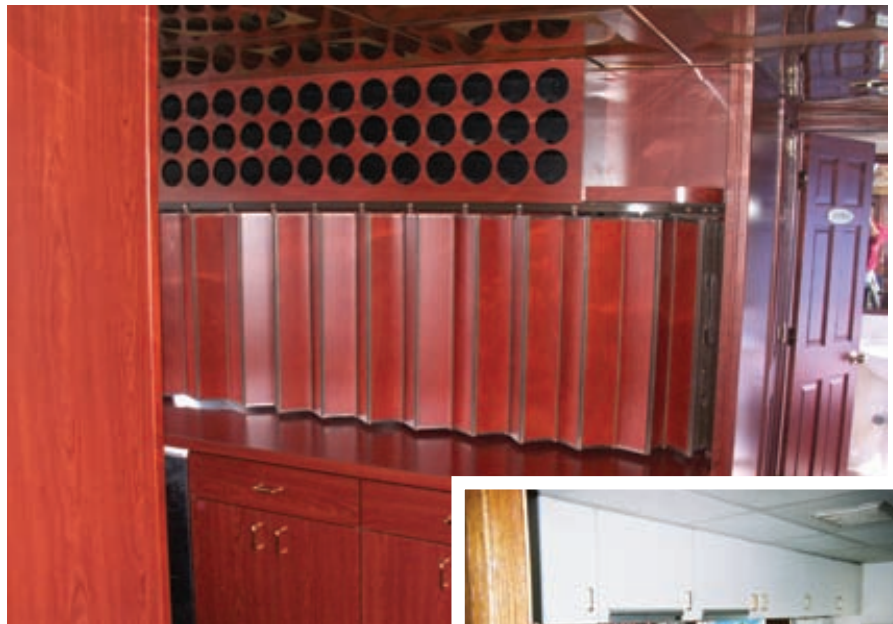
The new cabinetry was built in Wisconsin, shipped by truck, and installed on the vessel. Precise measurements were the key.

Getting the materials to the job site wasn't terribly difficult either. Clements hired the carrier who works closely with SkipperLiner on vessel delivery to drive a trailer full of the materials that would be needed to remodel the Tahoe Gal . In fact, the vessel was shipped via truck, in three separate pieces and put together onsite back in 1994 when it began its service on Lake Tahoe offering seasonal daily cruises, special cruises and private charters. Altogether, it was decided