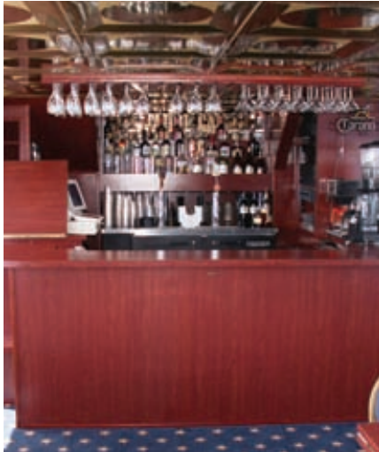
An attractive new bar was installed lending an air of elegance and sophistication.