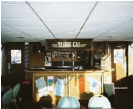
The existing bar was a focal point for all the wrong reasons.